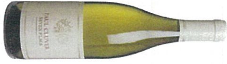
Paul Cluver, Seven Flags, Blgim 2015